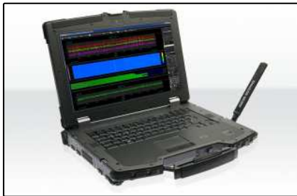
Outdoor Analyzers (Page 4)