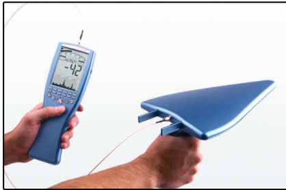
HandHeld Analyzers (Page 2)