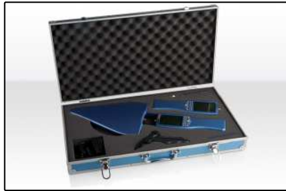
Analyzer Bundles (Page 3)