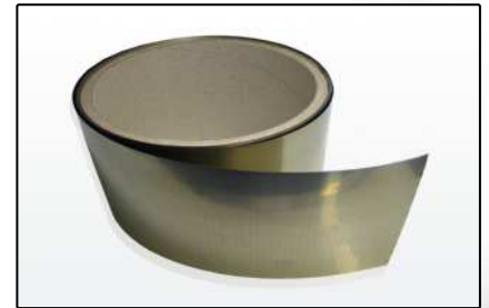
EMC Shielding materials (Pages 11-12)