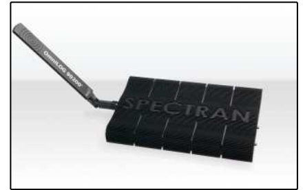
USB Analyzers (Page 4)