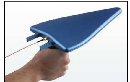
Directional Antennas (passive: Page 6, active: Page 7)