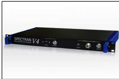
Rack Mount Analyzers (Page 5)