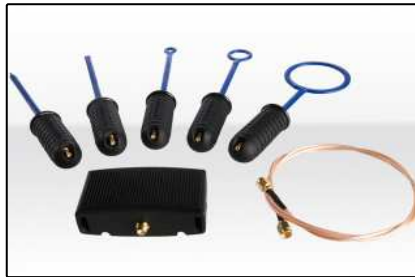
Probe Sets (Page 10)