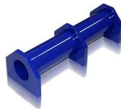
Zero Gauss Chamber