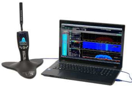
Handheld Analyzer with optional Docking Station