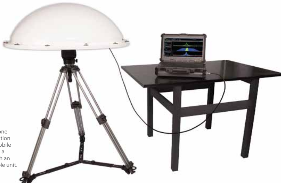
The most basic Drone Detector configuration is best suited to mobile operation. It teams a single antenna with an XFR V5 PRO portable unit.

The German company, Aaronia, recognised the need for a reliable method to detect tiny airborne intruders. Following a four-year development programme, it launched the Drone Detector, a product that exploits the radio-frequency (RF) radiation emitted by the UAV's onboard systems and by the operator's control unit. Real-time RF signal detection, combined with what the company terms "pattern triggering,"