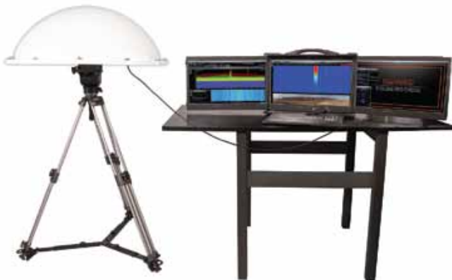
A fixed installation can use the Command Centre

Once a signal has been detected, its approximate bearing will be shown to an accuracy that depends on which model of antenna is being used. With the standard IsoLOG 3D 80-UWB, the bearing accuracy will be at least within the 45-degree