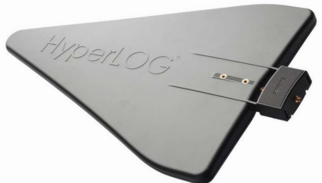
The BPSG as Field-Strength-Generator up to 3V/m (1m distance), available as „DFG 4060“

The BPSG can also be connected to an external reference clock and thus be synchronized with a measuring system. In addition, this way even higher accuracy can be achieved (Using an OCXO, Rubidium timebase etc.).