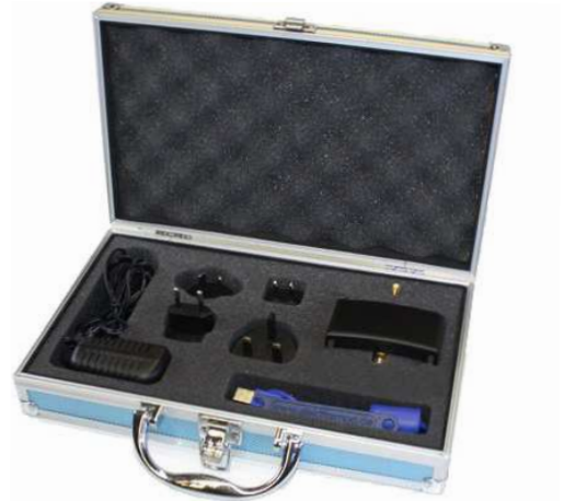
Scope of delivery: transport case, international 12V power supply, USB Cable, SMA/SMA (f/f) Adapter, SMA Tool, PC Software, Calibration data

With the very compact dimensions of just 80x50x30 mm and weighing only 150 grams, the BPSG series is predestined for mobile use and fits in every pocket. The compact form factor makes the BPSG the world's smallest battery-powered RF generator up to 6GHz.